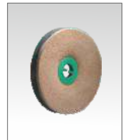
Pad holder available as option