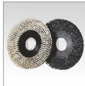
Variety of brushes to suit different applications.