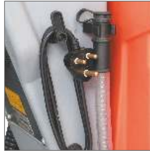
Comes with onboard charger as standard. Can be charged at any available plug socket.