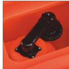
Easy tank cleaning, thanks to the large tank opening. Tank can be emptied quickly and easily via the large outlet hose. Overflow protection for the dirty water tank.