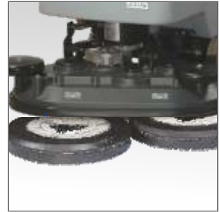
Brushes can be changed quickly without the need for any tools.