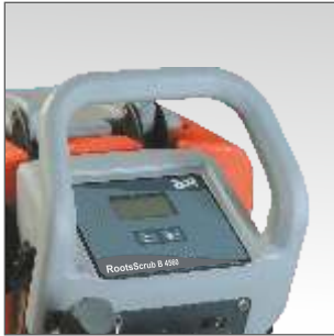
Ergonomic handle for operators of any height. Excellent view of the area to be cleaned. Soft touch buttons for selection of operation. LCD panel with display of hour meter, battery level.